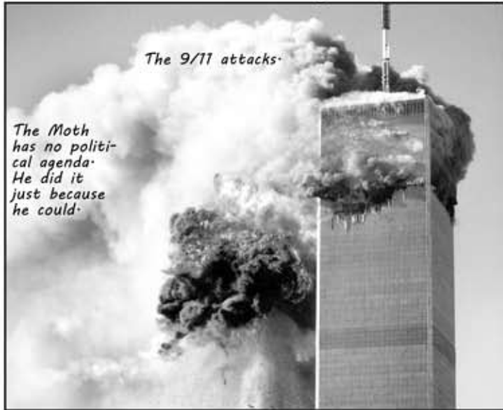
The 9/11 attacks.