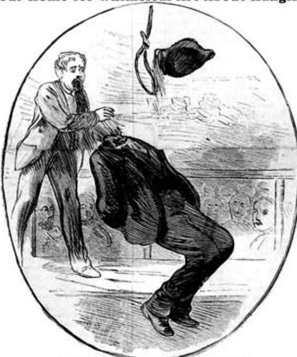
From the April 17, 1880, issue www.PoliceGazette.US

Copyright © 2013 by National Police Gazette Enterprises, LLC. All rights reserved. The National Police Gazette logo is a trademark of National Police Gazette Enterprises, LLC. ISSN 0047-9039. Printed in USA.